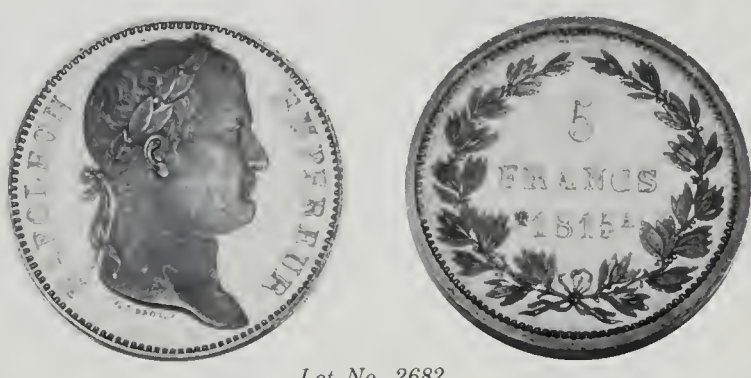
Lot No. 2682

Pattern 5 Francs, 1815 A. Obv. Mature laureate head by Droz. Rv. Value in wreath with the 2682 date between a small eagle and an A for Paris. V.G.2378. A lightly toned Brilliant plain edge (2,000-2,500)Proof. Very rare. (SEE COLOR PLATE)